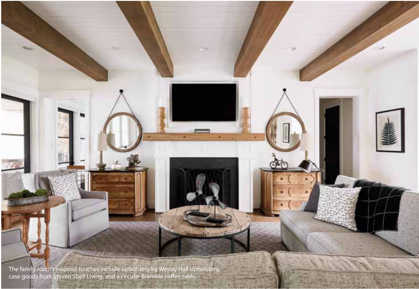
The family room's inspired touches include upholstery by Wesley Hall Upholstery, case goods from Steven Shell Living, and a circular Bramble coffee table.