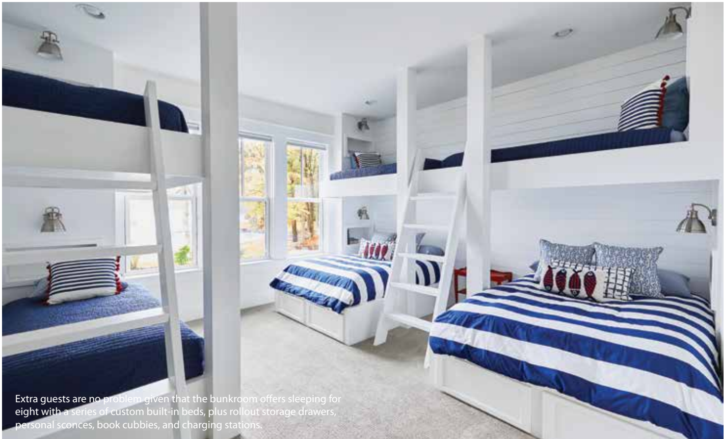
Extra guests are no problem given that the bunkroom offers sleeping for eight with a series of custom built-in beds, plus rollout storage drawers, personal sconces, book cubbies, and charging stations.